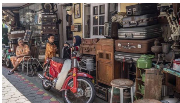
Fig. 1. A photo of the Mr. Link's house and its surroundings.

Residential buildings and antique equipments such as Mr. Link's house : This house is a place for collecting, buying, and selling antiques such as various old cameras, photo collections where in some occasions also holding event of photography workshops. Within this house, visitors can also see several collections of motorbikes and antique interior furniture. Therefore, for this particular reason, if visitors do not compelled to buy antiques, they can still use these various collections as backgrounds and complementary setting for their selfie photos.