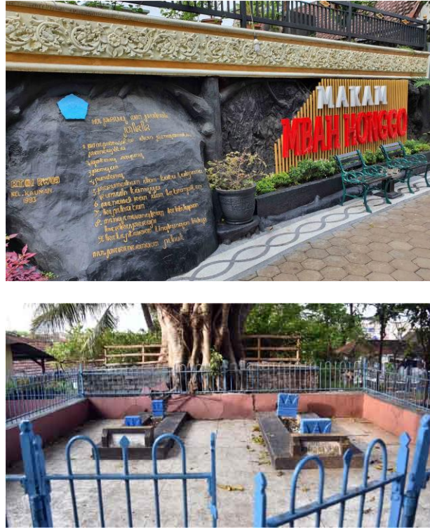
Fig. 5. Photos of Mbah Honggo's Tomb.