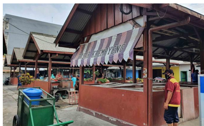
Fig. 4. A photo of building and atmosphere of Krempyeng Market.

This market is located in the middle of Kayutangan villager's settlement where the time of its establishment was the same time as the Kayutangan heritage village. According to the head of the Tourism Awareness Group (Pokdarwis) Rizal Fahmi, this market is called Krempyeng because it derives from meaning of the term krempyeng itself which can be interpreted as quickly disbanded. This market is indeed a one-time market, usually open in the morning and evening only to sell food items that prepared for residents to have morning breakfast and meal time in the afternoon after the residents come home from working activities.