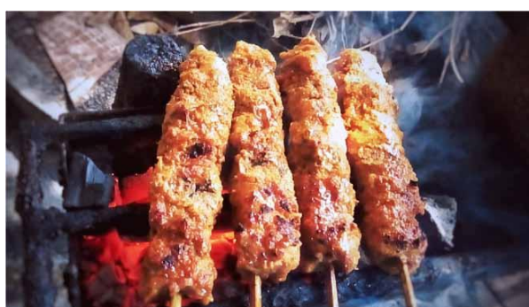
Fig. 2. A photo of Sate Gebug (a beef meat satay).

The distinctive Kayutangan cuisine at Warung Kuning Bu Nap (Mrs. Nap Yellow Stall)