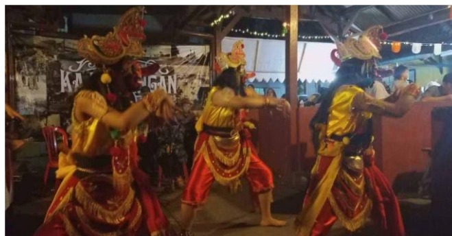
Fig. 3. Photos of mask dance in the atmosphere of Topeng Malangan Dance performance. One particular infrastructure in the Kayutangan heritage village is the market

The cultural arts in the Kayutangan heritage village : At certain times visitors can enjoy the Tari Topeng Malangan (Malangan Mask Dance) which held in the Krempyeng Market area. The dance will be performed by Polowijen Cultural Village dancers. According to Mila Kurniawati, a member of the Kelompok Sadar Wisata/POKDARWIS (Tourism Awareness Group), the Malangan Mask dancer is often called to perform in the Kayutangan heritage village on certain occasions. This is an effort to add attractiveness side for tourists who visit this area by raising the typical Malangan culture.