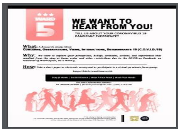
Figure 2 Local Research Study Flyer

Scholarship: My research pivoted to focus on questions that were specifically COVID-19 related. One study was a department effort that surveyed 10,500 older adults in the U.S on their pre and post COVID-19 health-related quality of life. The second was a local study in Ward 5 of Washington, DC on the perceptions of COVID-19 restrictions and vaccine uptake. Both studies were approved by UDC's Institutional Review Board (IRB) and the latter has produced a publish article and is informing DC Council on policy regarding the issues identified. The local study was more difficult to collect data than the larger nation-wide study. Due to COVID-19 partner sites not being open to post flyers, most of the data was collected via snowballing methods and emailing the study flyer (figure 2) to family, friends, and colleagues.