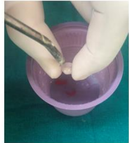
Fig-9: Surface treatment of intaglio surface of veneers