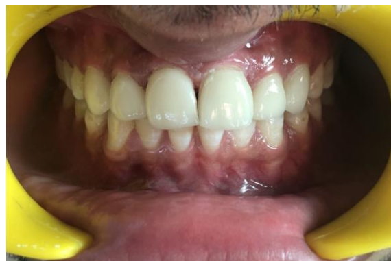
Fig10: Postoperative Clinical picture