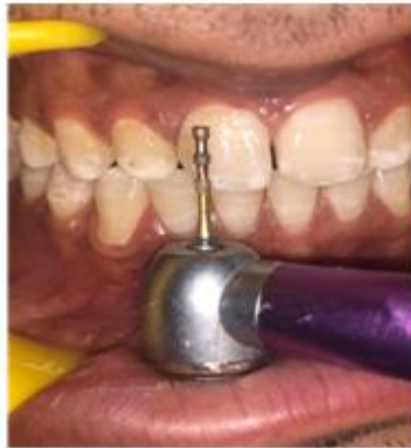
Fig-4: Veneer preparation using wheeled diamond bur