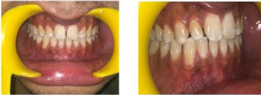
Fig-1:Preoperative Clinical pictures