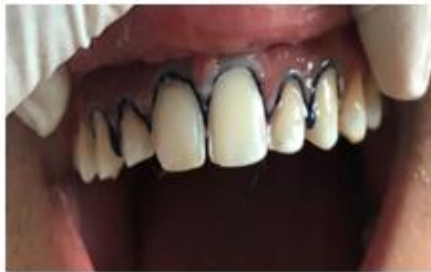
Fig-6: Retraction cord placement before