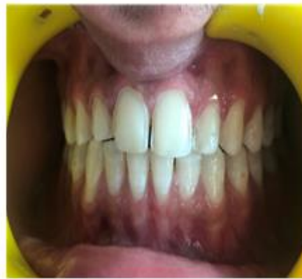
Fig-5: Post veneer preparation picture