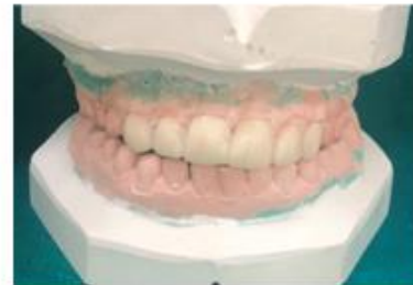
Fig-8: Provisional restoration