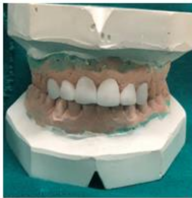
Fig-2: Waxed up restorations

Also Shade Selection was done in natural daylight in an afternoon. Shade selected was B1.